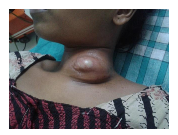
Branchial cyst with abscess at the time of presentation

She had undergone incision and drainage of the neck abscess elsewhere at least 5 times within these 2 years. Clinical examination reveals a soft, fluctuant, tender, ovoid swelling approximately 7cmx 5cm in its greatest dimensions .Extending from anterior border of (L) sternocleidomastoid muscle to about 1 cm lateral to midline. Vertically it extended from the level of hyoid to the junction of middle & lower 1/3 of anterior border of (L) sternocleidomastoid muscle.