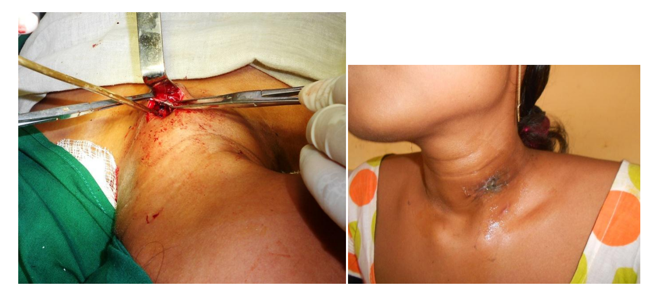
(A) Intra-operative pic during excision of cyst