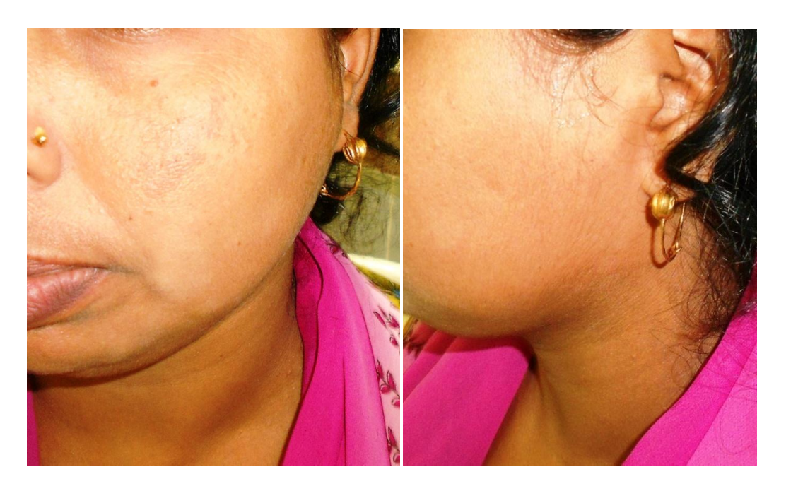
(L) parotid gland swelling at the time of presentation.